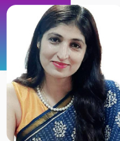
Dr. Vinita Pandey Centre for Oncopathology